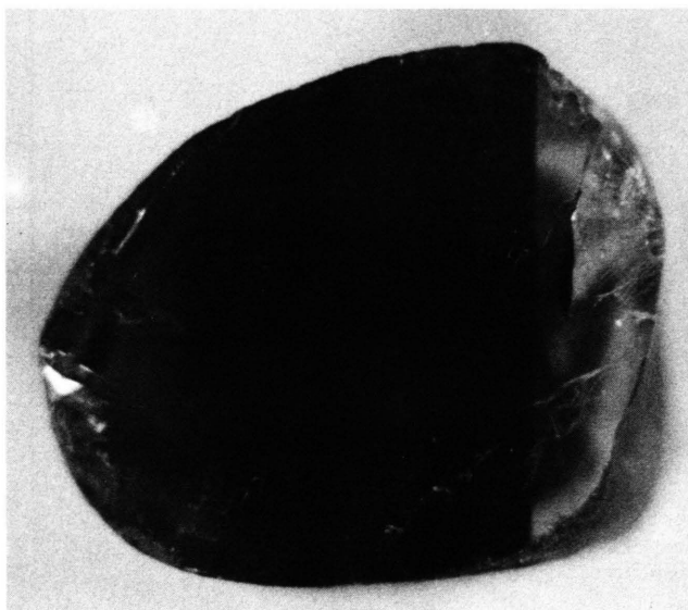
Fig. 2. Effect of \gamma -irradiation in topaz (second type): Crystal plate (001) cut perpendicular to the c -axis; sharp boundary between the brown and colourless part of the crystal.

0932-0784 / 92 / 0700-0923 $ 01.30/0. – Please order a reprint rather than making your own copy.